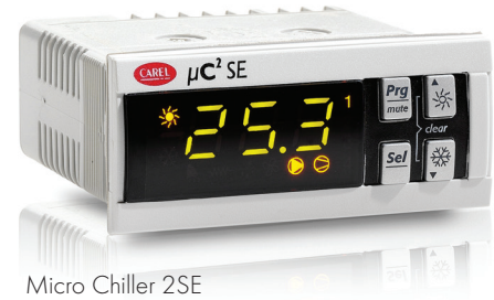
Micro Chiller 2SE